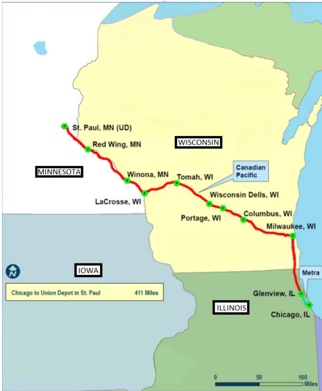
Figure 1: Amtrak Empire Builder Route and Stations between St. Paul and Chicago

Passenger trains provide long-distance, short-distance, intercity travel, daily commuter trips, or local urban transit services. These services include a diversity of vehicles, operating speeds, right-of-way requirements, and service frequency. Several terms are used throughout this document as follows: