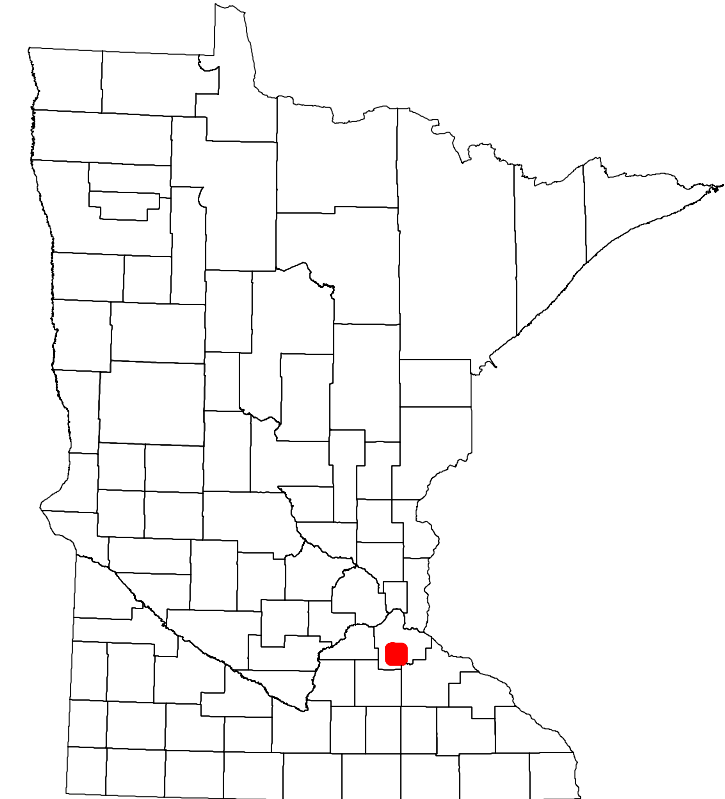
Population (U.S. Census 2010): 1342